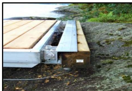
Shore Beam & Angle