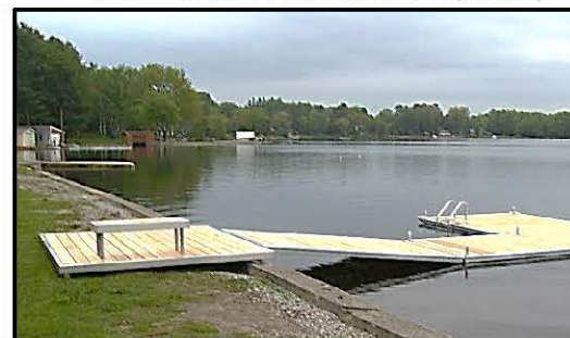
Shore Platform (Sand & Clay)