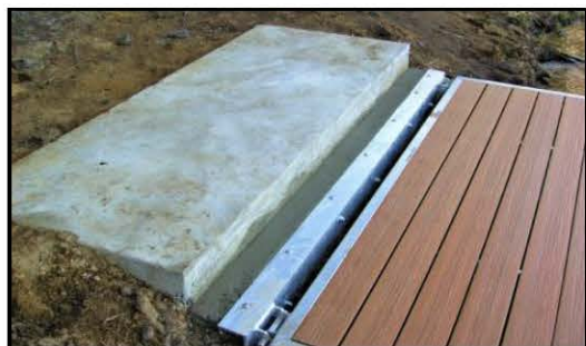
Concrete Angle on New Concrete

* Note: Concrete Pour Available Separately