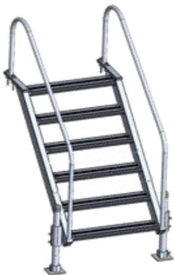
Water Entry Staircase