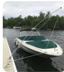
Premium Mooring Whips