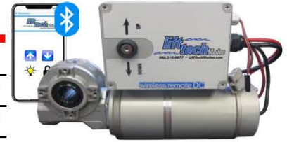
Boat Lift Motor