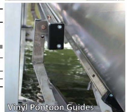
Vinyl Pontoon Guides